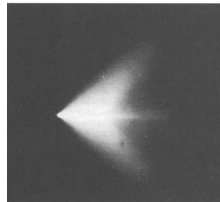
Apollo 8 translunar injection burn observed at twilight